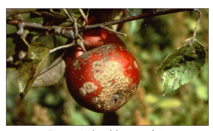
Figure 2. Apple scab lesions on fruit.