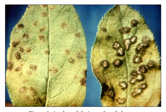
Figure 1. Apple scab lesions of apple leaves.

Symptoms first appear in the spring as spots (lesions) on the lower leaf surface, the side first exposed to fungal spores as buds open. At first, the lesions are usually small, velvety, olive green in color, and have unclear margins. On some crabapples, infections may be reddish in color. As they age, the infections become darker and more distinct